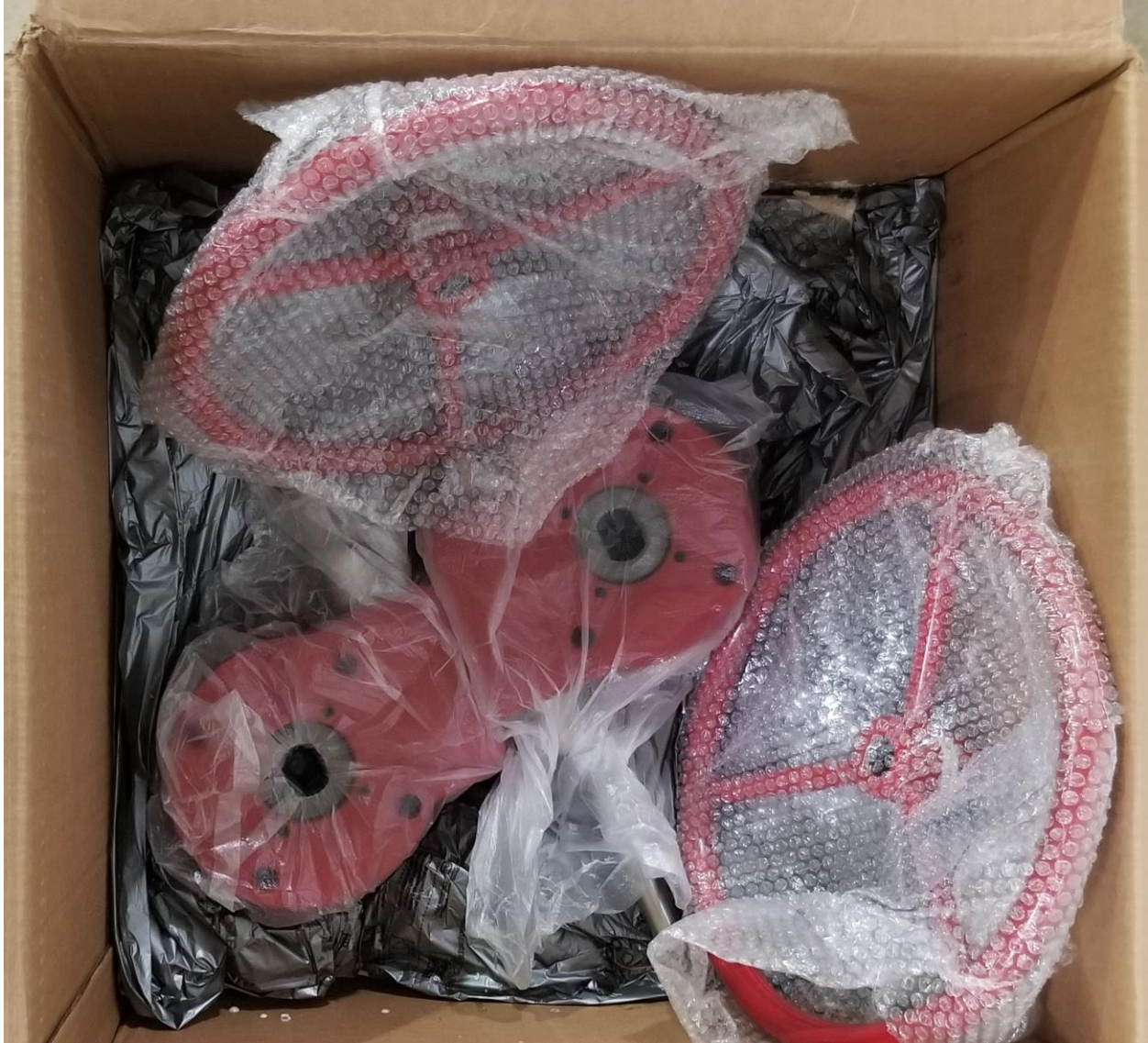
Kevin order replacement actuators. We were shipped actuator that were to large, We are currently waiting for the replacement actuators .