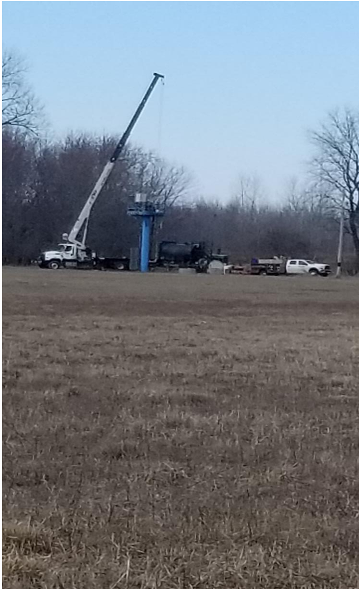
Brotke in the well field pulling well #1