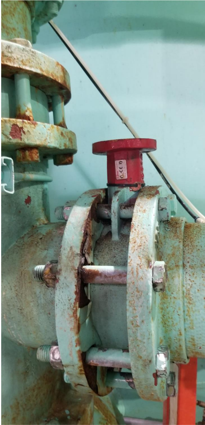
Softener #3 valve quit functioning correctly.